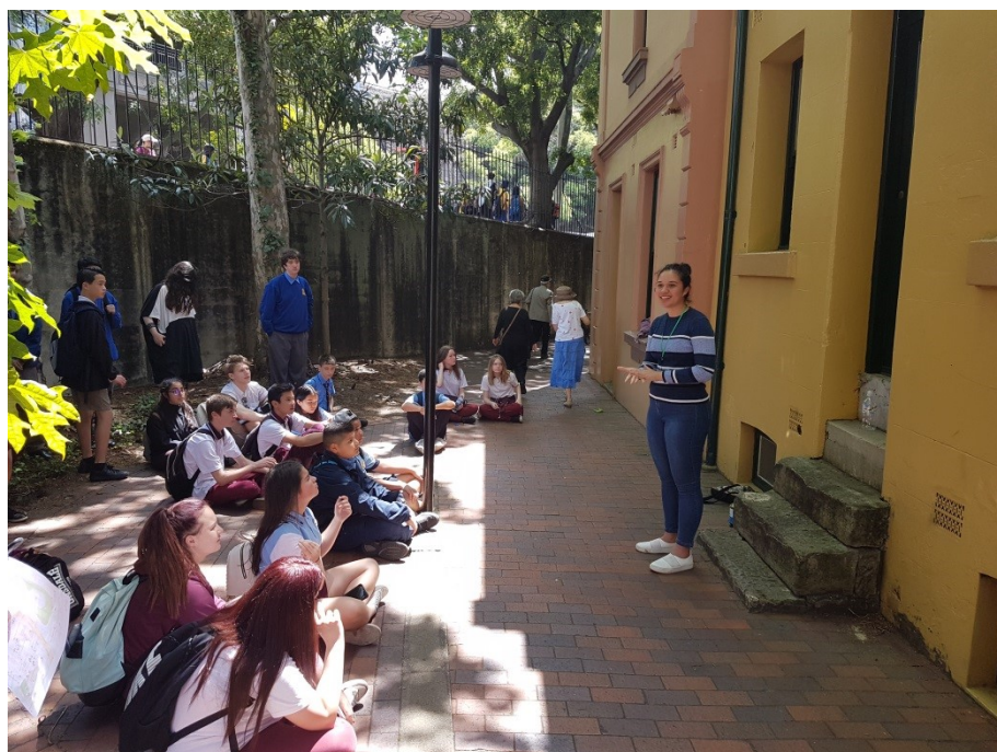
Watching live poetry