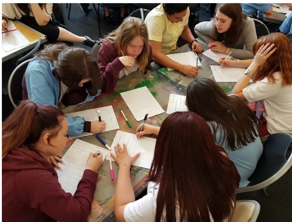
Year 9 girls working hard on their poetry.