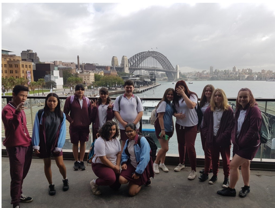
Arriving at Circular Quay

On Friday the 13th, 15 students from across grades 8, 9 and 10 went into The Rocks, Sydney, for the annual Poetry Slam run by Story Fest. Students had the opportunity to develop their skills at poetry writing and to walk through The Rocks where they viewed live poetry performed by the organisers. To cap off the day students then had a chance to check out the local market stalls and grab some ice cream by the harbour.